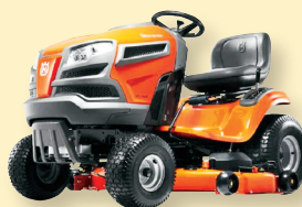
Husqvarna Riding Lawn Mower