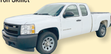
2012 Chevrolet Silverado