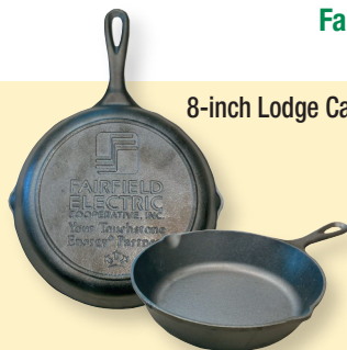
8-inch Lodge Cast Iron Skillet

Fairfield County — Friday, May 20, 2022 — Fairfield Electric Cooperative's Winnsboro Office — 7 a.m. to Noon